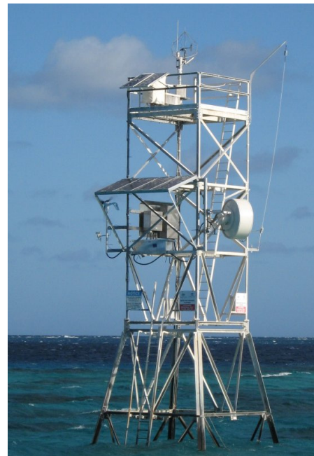
Figure 2: Davies Reef Weather Station

A Sensor Gateway has been deployed at Davies Reef to provide a real world demonstrator in the area of sensor networks. This has been a complex undertaking with power and communication systems needing development in addition to the sensor system. The goal of this demonstrator was to understand the requirement of sensor networks from the connection of sensors to the network (DMQ1), connecting sensors to storage repositories (DMQ2), ensuring data from instruments and sensors is of sufficient quality for curation (DMQ3), remote control of instruments (DMQ4) and data processing (DMQ5).